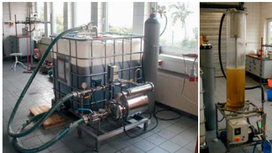
Fig. 3: Test plants

Fig. 4 shows the oxygen content of a linseed oil depending on processing time exemplarily. It was possible to decrease the oxygen content in the oil from 32 mg O 2 / kg oil to 0.5 mg O 2 / kg oil within 12 minutes. The specific nitrogen demand was 0.1126 g/kg oil · min and can be reduced by technological means.