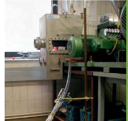
Fig. 1: Enclosed press

One possibility is pressing under nitrogen atmosphere using an enclosed press which is completely aerated by nitrogen. Fig. 1 shows the used equipment. Rapeseed and linseed oil were recovered from the seeds. By both feeding seeds and discharging oil and press cake high losses of nitrogen occur and entering of oxygen can not totally be avoided. As the main result it was found that oxygen contents below 2 mg O 2 / kg oil are not to be succeeded.